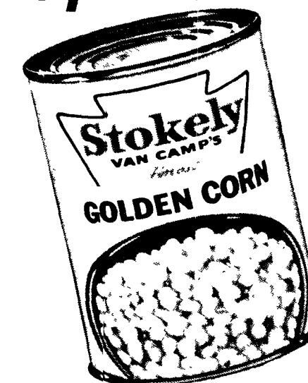
KERNEL of CREAM — 303's 5/$1.00