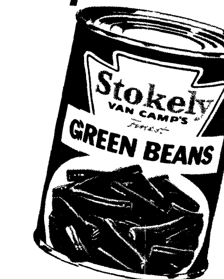
1 NO. 303's 5/$1.00