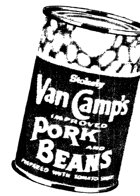
THE BIG NO. 2½ CANS 4/$1.00