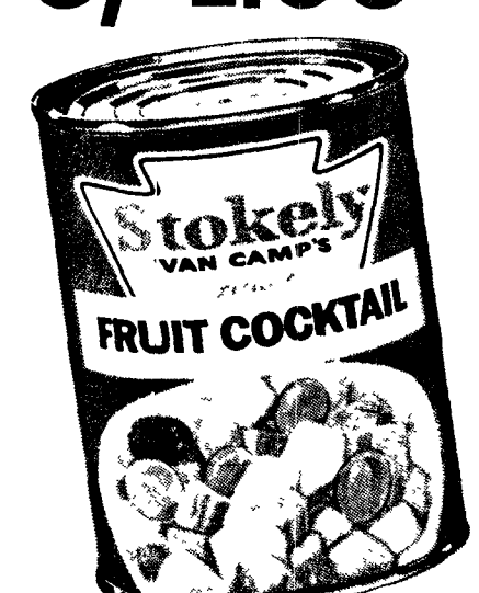
NO. 303's 5/$1.00